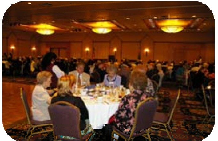
Saturday Dinner had a full house.