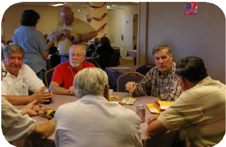
Ice breaker tales from then and now...