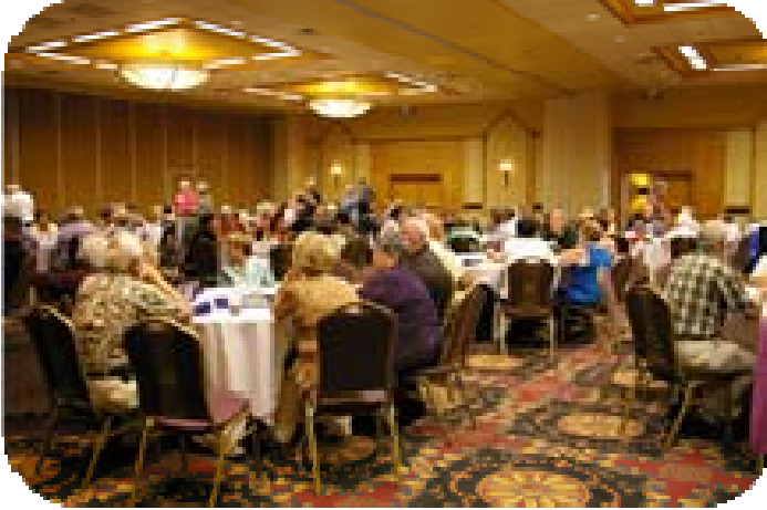
Event was well attended.